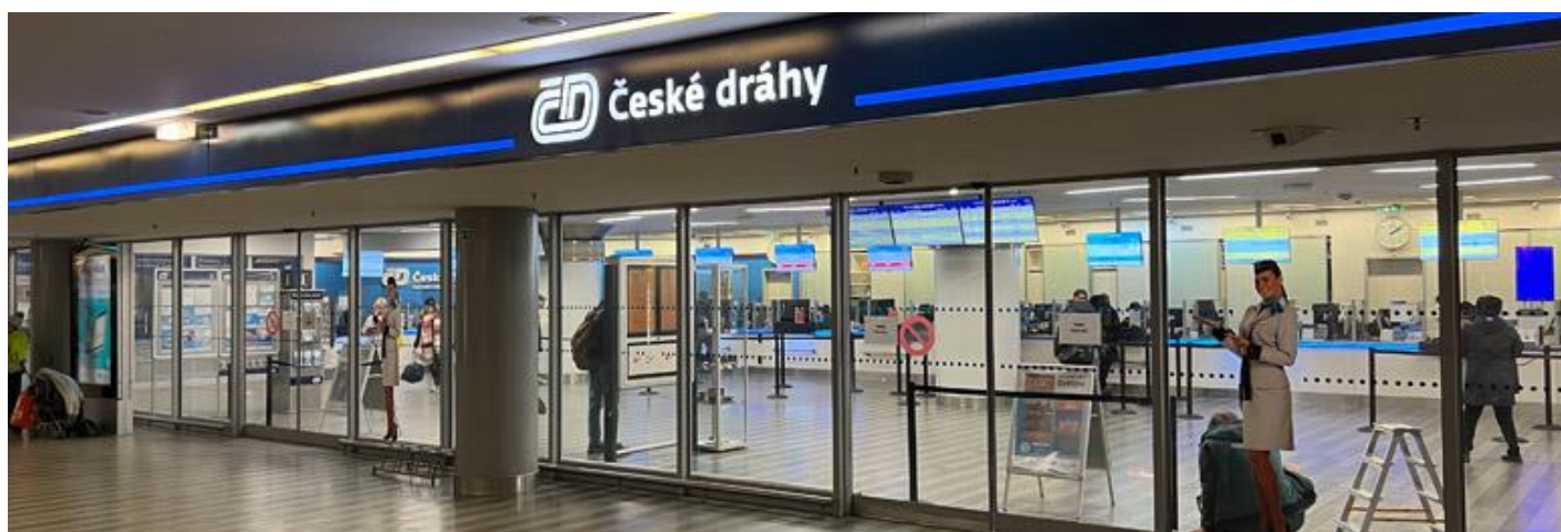
ČD Ticket Offices